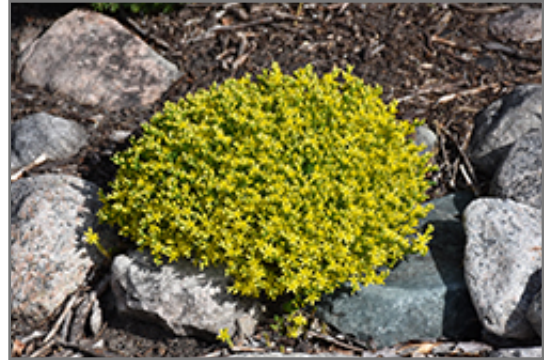
Golden Moss Stonecrop in bloom

Golden Moss Stonecrop is recommended for the following landscape applications;