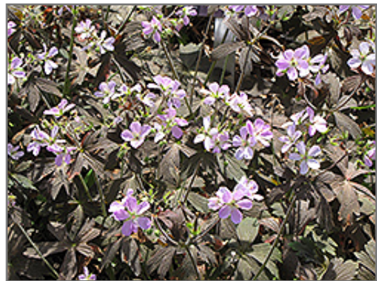
Espresso Cranesbill flowers