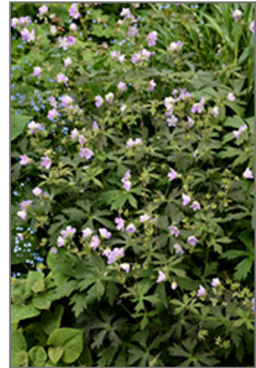
Espresso Cranesbill in bloom

Espresso Cranesbill is a fine choice for the garden, but it is also a good selection for planting in outdoor pots and containers. It is often used as a 'filler' in the 'spiller-thriller-filler' container combination, providing a mass of flowers and foliage against which the thriller plants stand out. Note that when growing plants in outdoor containers and baskets, they may require more frequent waterings than they would in the yard or garden.