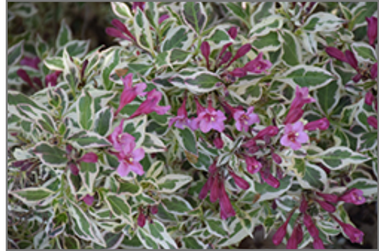
My Monet Weigela flowers

My Monet Weigela is recommended for the following landscape applications;