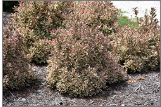
My Monet Weigela

My Monet Weigela makes a fine choice for the outdoor landscape, but it is also well-suited for use in outdoor pots and containers. It is often used as a 'filler' in the 'spiller-thriller-filler' container combination, providing a mass of flowers and foliage against which the thriller plants stand out. Note that when grown in a container, it may not perform exactly as indicated on the tag - this is to be expected. Also note that when growing plants in outdoor containers and baskets, they may require more frequent waterings than they would in the yard or garden.