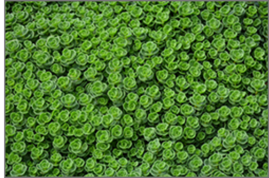
John Creech Stonecrop foliage

John Creech Stonecrop will grow to be only 3 inches tall at maturity, with a spread of 12 inches. When grown in masses or used as a bedding plant, individual plants should be spaced approximately 10 inches apart. Its foliage tends to remain low and dense right to the ground. It grows at a fast rate, and under ideal conditions can be expected to live for approximately 10 years. As an herbaceous perennial, this plant will usually die back to the crown each winter, and will regrow from the base each spring. Be careful not to disturb the crown in late winter when it may not be readily seen!