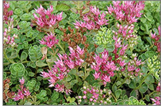
John Creech Stonecrop flowers

John Creech Stonecrop is recommended for the following landscape applications;