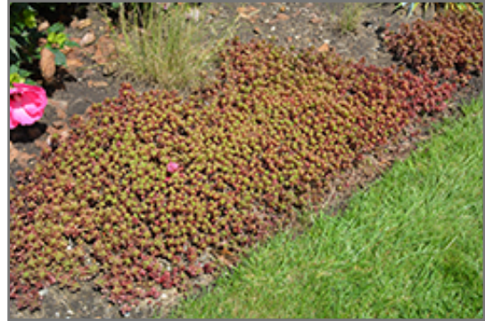
Fulda Glow Stonecrop

Fulda Glow Stonecrop is a fine choice for the garden, but it is also a good selection for planting in outdoor pots and containers. Because of its spreading habit of growth, it is ideally suited for use as a 'spiller' in the 'spiller-thriller-filler' container combination; plant it near the edges where it can spill gracefully over the pot. Note that when growing plants in outdoor containers and baskets, they may require more frequent waterings than they would in the yard or garden.