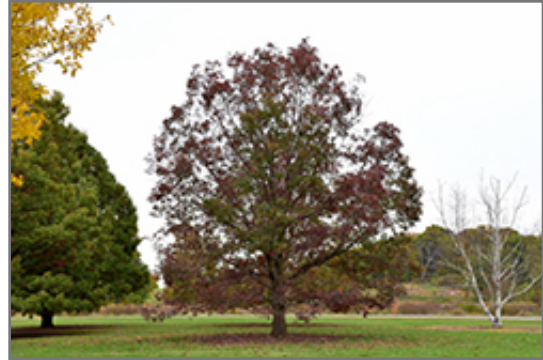
White Oak in fall

This tree should only be grown in full sunlight. It is very adaptable to both dry and moist locations, and should do just fine under average home landscape conditions. It is not particular as to soil type, but has a definite preference for acidic soils. It is highly tolerant of urban pollution and will even thrive in inner city environments. This species is native to parts of North America.