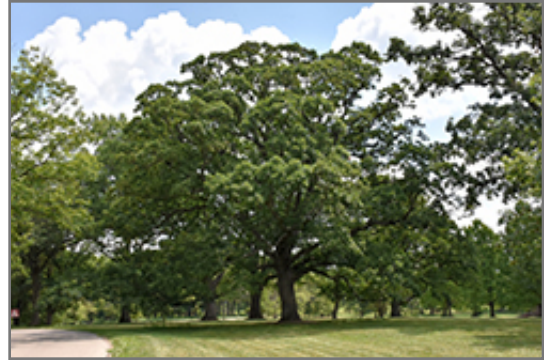
White Oak