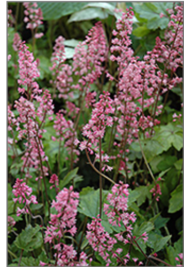
Dayglow Pink Foamy Bells flowers

This is a relatively low maintenance plant, and is best cleaned up in early spring before it resumes active growth for the season. It is a good choice for attracting hummingbirds to your yard. It has no significant negative characteristics.