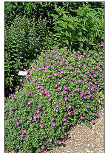
Max Frei Cranesbill in bloom