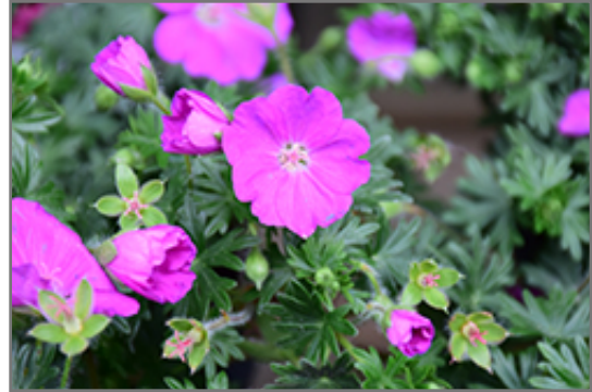
Max Frei Cranesbill flowers

Max Frei Cranesbill is a fine choice for the garden, but it is also a good selection for planting in outdoor pots and containers. It is often used as a 'filler' in the 'spiller-thriller-filler' container combination, providing a mass of flowers against which the thriller plants stand out. Note that when growing plants in outdoor containers and baskets, they may require more frequent waterings than they would in the yard or garden.