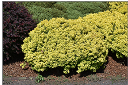
Golden Nugget Japanese Barberry