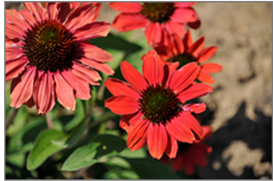
Color Coded Frankly Scarlet Coneflower flowers