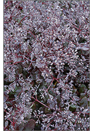
Bertram Anderson Stonecrop flowers

Bertram Anderson Stonecrop is recommended for the following landscape applications;