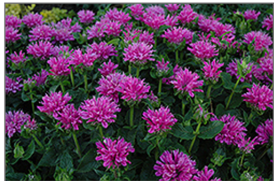
Petite Delight Beebalm flowers