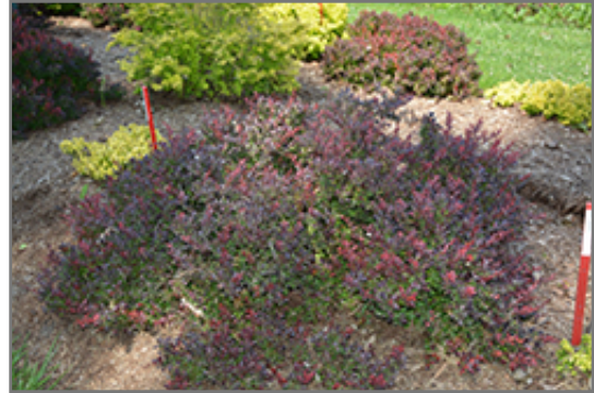
Sunjoy Todo Japanese Barberry

Sunjoy Todo Japanese Barberry will grow to be about 24 inches tall at maturity, with a spread of 24 inches. It tends to fill out right to the ground and therefore doesn't necessarily require facer plants in front. It grows at a medium rate, and under ideal conditions can be expected to live for approximately 20 years.