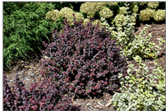
Sunjoy Todo Japanese Barberry