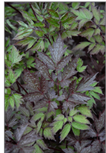
Black Negligee Bugbane foliage