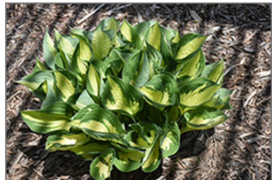
Morning Light Hosta