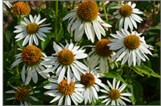
Happy Star Coneflower flowers

This is a relatively low maintenance plant, and is best cleaned up in early spring before it resumes active growth for the season. It is a good choice for attracting butterflies to your yard, but is not particularly attractive to deer who tend to leave it alone in favor of tastier treats. It has no significant negative characteristics.