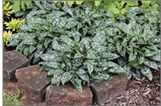
Twinkle Toes Lungwort

Twinkle Toes Lungwort will grow to be about 12 inches tall at maturity, with a spread of 18 inches. When grown in masses or used as a bedding plant, individual plants should be spaced approximately 15 inches apart. Its foliage tends to remain dense right to the ground, not requiring facer plants in front. It grows at a medium rate, and under ideal conditions can be expected to live for approximately 10 years. As an herbaceous perennial, this plant will usually die back to the crown each winter, and will regrow from the base each spring. Be careful not to disturb the crown in late winter when it may not be readily seen!