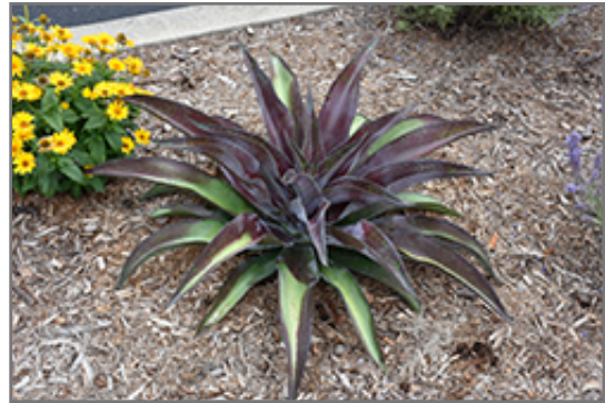
Mission to Mars Mangave

This is a relatively low maintenance plant, and is best cleaned up in early spring before it resumes active growth for the season. Deer don't particularly care for this plant and will usually leave it alone in favor of tastier treats. It has no significant negative characteristics.