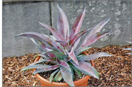
Mission to Mars Mangave

Mission to Mars Mangave will grow to be about 10 inches tall at maturity, with a spread of 22 inches. It grows at a fast rate, and under ideal conditions can be expected to live for approximately 5 years. As an herbaceous perennial, this plant will usually die back to the crown each winter, and will regrow from the base each spring. Be careful not to disturb the crown in late winter when it may not be readily seen!