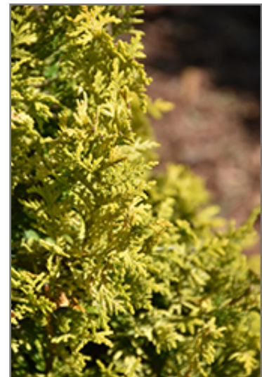
Soft Serve Gold Falsecypress foliage