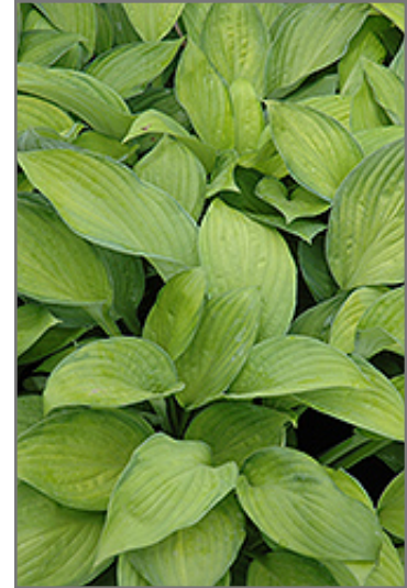
Gold Standard Hosta foliage

Gold Standard Hosta is recommended for the following landscape applications;