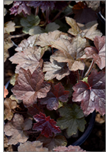
Palace Purple Coral Bells foliage

Palace Purple Coral Bells is recommended for the following landscape applications;