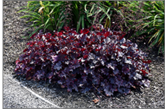
Plum Pudding Coral Bells

Plum Pudding Coral Bells is a fine choice for the garden, but it is also a good selection for planting in outdoor pots and containers. It is often used as a 'filler' in the 'spiller-thriller-filler' container combination, providing a mass of flowers and foliage against which the larger thriller plants stand out. Note that when growing plants in outdoor containers and baskets, they may require more frequent waterings than they would in the yard or garden.