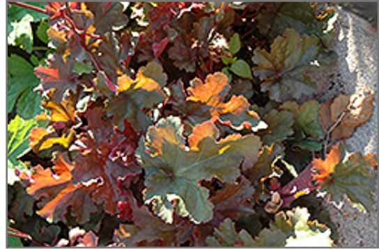
Chocolate Ruffles Coral Bells foliage

Chocolate Ruffles Coral Bells is a fine choice for the garden, but it is also a good selection for planting in outdoor pots and containers. With its upright habit of growth, it is best suited for use as a 'thriller' in the 'spiller-thriller-filler' container combination; plant it near the center of the pot, surrounded by smaller plants and those that spill over the edges. Note that when growing plants in outdoor containers and baskets, they may require more frequent waterings than they would in the yard or garden.