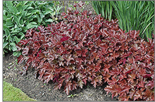
Chocolate Ruffles Coral Bells

This is a relatively low maintenance plant, and should be cut back in late fall in preparation for winter. It is a good choice for attracting hummingbirds to your yard. It has no significant negative characteristics.