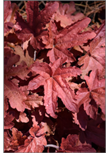
Fun and Games Red Rover Foamy Bells foliage

Fun and Games Red Rover Foamy Bells is a dense herbaceous evergreen perennial with tall flower stalks held atop a low mound of foliage. Its relatively fine texture sets it apart from other garden plants with less refined foliage.