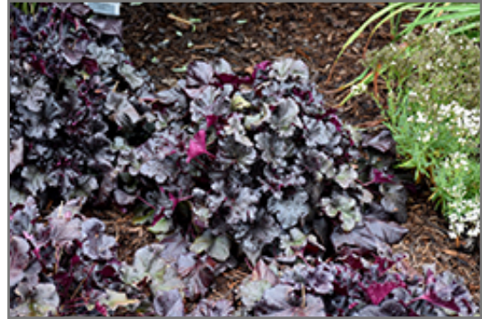
Black Pearl Coral Bells

Black Pearl Coral Bells is a fine choice for the garden, but it is also a good selection for planting in outdoor pots and containers. With its upright habit of growth, it is best suited for use as a 'thriller' in the 'spiller-thriller-filler' container combination; plant it near the center of the pot, surrounded by smaller plants and those that spill over the edges. Note that when growing plants in outdoor containers and baskets, they may require more frequent waterings than they would in the yard or garden.