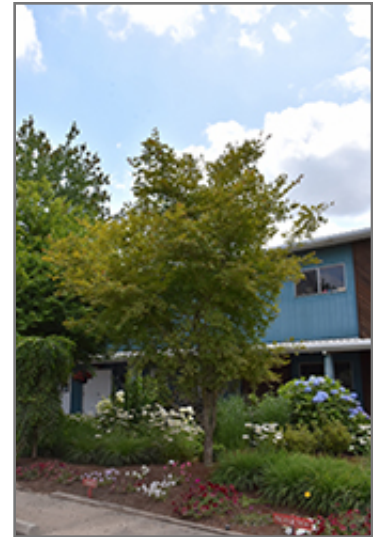
Northern Glow Maple

This tree does best in full sun to partial shade. It does best in average to evenly moist conditions, but will not tolerate standing water. It is not particular as to soil type or pH. It is somewhat tolerant of urban pollution. This particular variety is an interspecific hybrid.