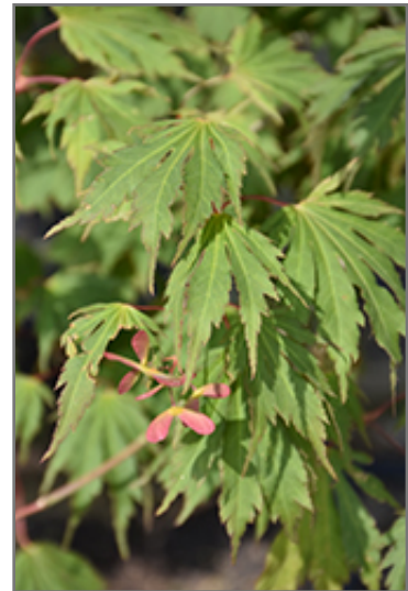
Northern Glow Maple foliage