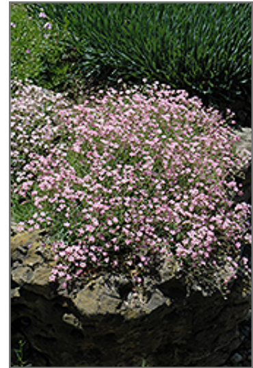
Pink Creeping Baby's Breath in bloom