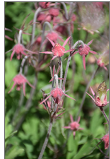
Prairie Smoke flower buds