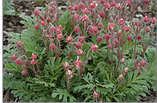
Prairie Smoke in bloom

Prairie Smoke is an herbaceous perennial with an upright spreading habit of growth. Its relatively fine texture sets it apart from other garden plants with less refined foliage.