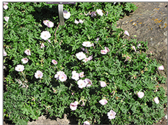
Striated Cranesbill in bloom