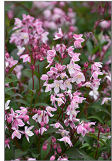
Yuki Cherry Blossom Deutzia flowers