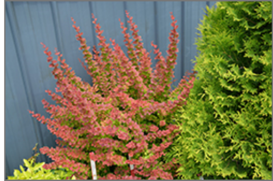
Sunjoy Tangelo Japanese Barberry

Sunjoy Tangelo Japanese Barberry makes a fine choice for the outdoor landscape, but it is also well-suited for use in outdoor pots and containers. Because of its height, it is often used as a 'thriller' in the 'spiller-thriller-filler' container combination; plant it near the center of the pot, surrounded by smaller plants and those that spill over the edges. It is even sizeable enough that it can be grown alone in a suitable container. Note that when grown in a container, it may not perform exactly as indicated on the tag - this is to be expected. Also note that when growing plants in outdoor containers and baskets, they may require more frequent waterings than they would in the yard or garden.