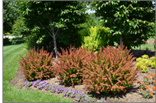
Sunjoy Tangelo Japanese Barberry