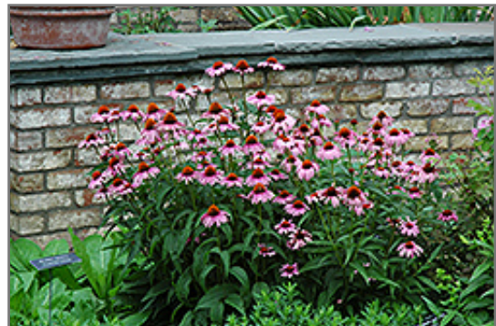
Magnus Coneflower in bloom