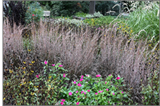
Standing Ovation Bluestem in fall

Standing Ovation Bluestem is recommended for the following landscape applications;