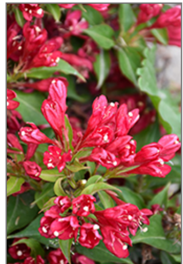
Crimson Kisses Weigela flowers