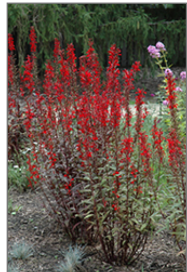
Black Truffle Cardinal Flower in bloom