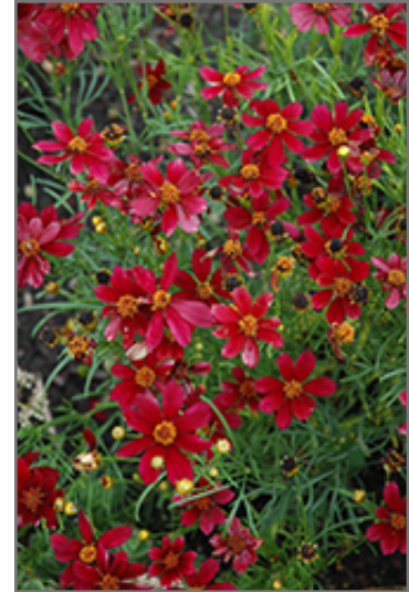
Red Satin Tickseed flowers