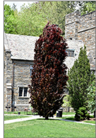
Red Obelisk Beech