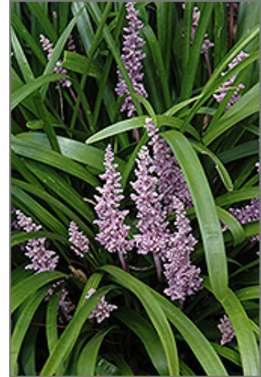
Lily Turf flowers

Lily Turf is recommended for the following landscape applications;