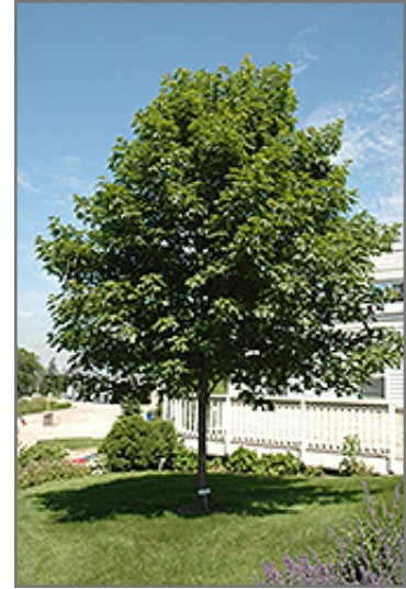
Fall Fiesta Sugar Maple

This tree should only be grown in full sunlight. It prefers to grow in average to moist conditions, and shouldn't be allowed to dry out. It is not particular as to soil pH, but grows best in rich soils. It is somewhat tolerant of urban pollution. This is a selection of a native North American species.