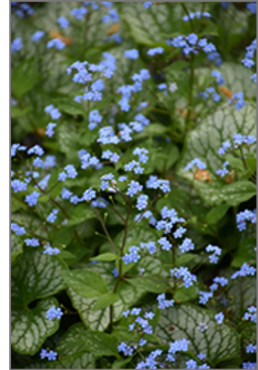
Sea Heart Bugloss flowers

Sea Heart Bugloss is recommended for the following landscape applications;