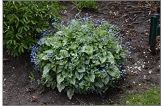
Sea Heart Bugloss in bloom

Sea Heart Bugloss is a fine choice for the garden, but it is also a good selection for planting in outdoor pots and containers. It is often used as a 'filler' in the 'spiller-thriller-filler' container combination, providing a mass of flowers and foliage against which the thriller plants stand out. Note that when growing plants in outdoor containers and baskets, they may require more frequent waterings than they would in the yard or garden.