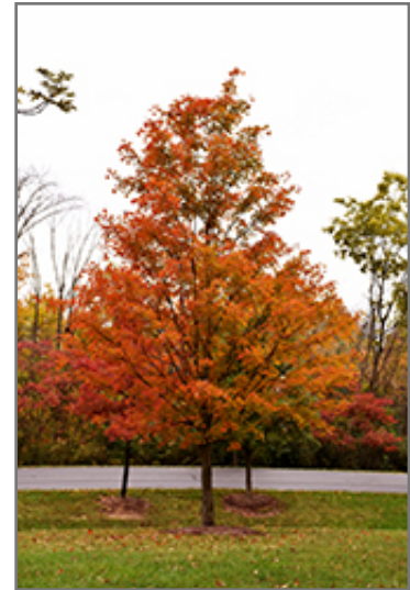
Norwegian Sunset Maple in fall