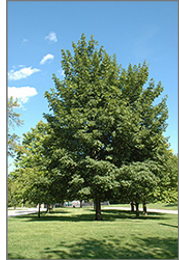
Norwegian Sunset Maple

* This is a 'special order' plant - contact store for details