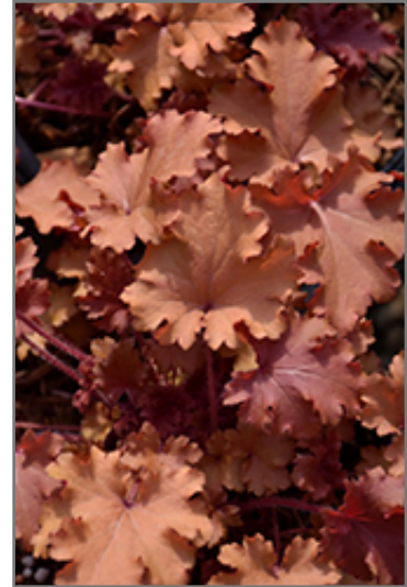
Peach Crisp Coral Bells foliage

Peach Crisp Coral Bells is a fine choice for the garden, but it is also a good selection for planting in outdoor pots and containers. With its upright habit of growth, it is best suited for use as a 'thriller' in the 'spiller-thriller-filler' container combination; plant it near the center of the pot, surrounded by smaller plants and those that spill over the edges. Note that when growing plants in outdoor containers and baskets, they may require more frequent waterings than they would in the yard or garden.