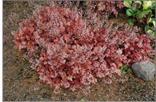
Peach Crisp Coral Bells in bloom

This is a relatively low maintenance plant, and should be cut back in late fall in preparation for winter. It is a good choice for attracting hummingbirds to your yard. It has no significant negative characteristics.