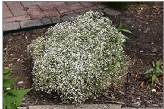
Summer Sparkles Baby's Breath in bloom