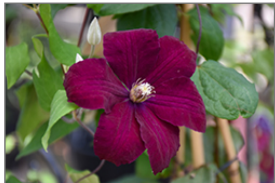
Rouge Cardinal Clematis flowers