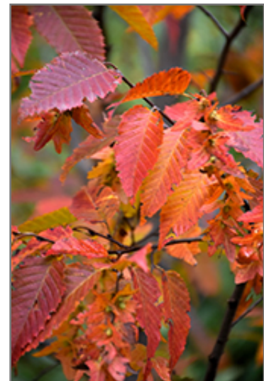
Firespire American Hornbeam in fall