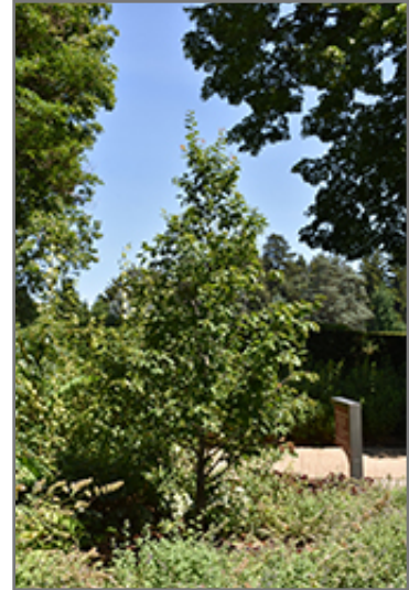
Firespire American Hornbeam

This tree performs well in both full sun and full shade. It is an amazingly adaptable plant, tolerating both dry conditions and even some standing water. It is not particular as to soil type or pH. It is somewhat tolerant of urban pollution. This is a selection of a native North American species.