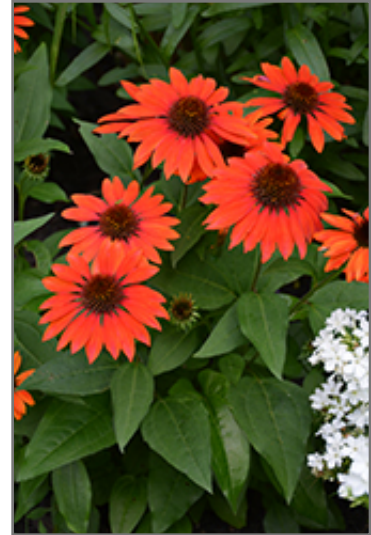
Sombbrero Flamenco Orange Coneflower in bloom

Sombbrero Flamenco Orange Coneflower is recommended for the following landscape applications;