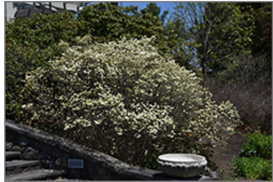
Dwarf Fothergilla in bloom