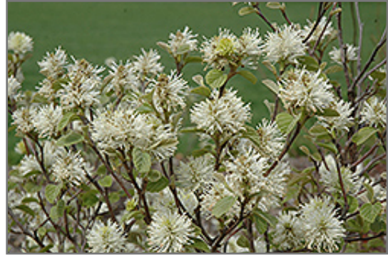
Dwarf Fothergilla flowers

This shrub does best in full sun to partial shade. It requires an evenly moist well-drained soil for optimal growth, but will die in standing water. It is not particular as to soil type, but has a definite preference for acidic soils, and is subject to chlorosis (yellowing) of the foliage in alkaline soils. It is somewhat tolerant of urban pollution. This species is native to parts of North America.