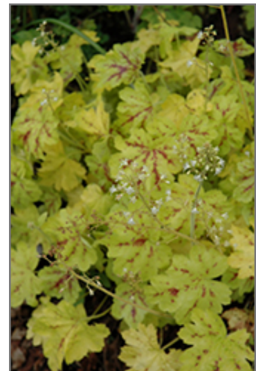
Solar Power Foamy Bells flowers