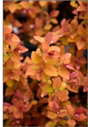
Double Play Big Bang Spirea foliage

This shrub should only be grown in full sunlight. It prefers to grow in average to moist conditions, and shouldn't be allowed to dry out. It is not particular as to soil type or pH. It is highly tolerant of urban pollution and will even thrive in inner city environments. This particular variety is an interspecific hybrid.