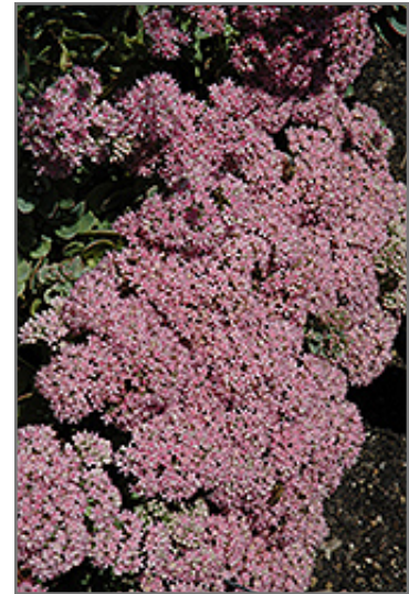
Lime Zinger Stonecrop flowers

This is a relatively low maintenance plant, and is best cleaned up in early spring before it resumes active growth for the season. It is a good choice for attracting bees and butterflies to your yard, but is not particularly attractive to deer who tend to leave it alone in favor of tastier treats. It has no significant negative characteristics.