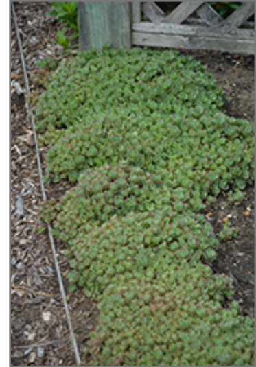
Lime Zinger Stonecrop

Lime Zinger Stonecrop will grow to be only 4 inches tall at maturity extending to 6 inches tall with the flowers, with a spread of 18 inches. When grown in masses or used as a bedding plant, individual plants should be spaced approximately 15 inches apart. Its foliage tends to remain low and dense right to the ground. It grows at a fast rate, and under ideal conditions can be expected to live for approximately 15 years. As an herbaceous perennial, this plant will usually die back to the crown each winter, and will regrow from the base each spring. Be careful not to disturb the crown in late winter when it may not be readily seen!